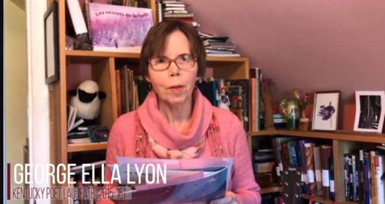
GEORGE ELLA LYON KENTUCKY POET LAUREATE (2015-16)