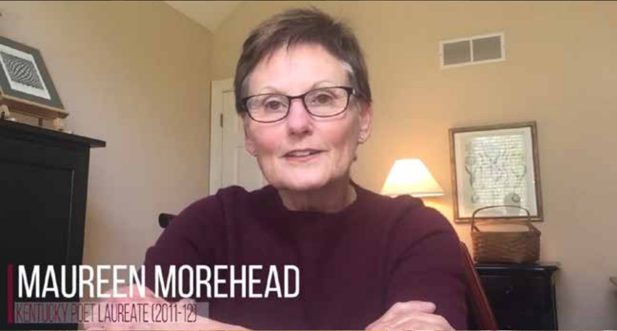
MAUREEN MOREHEAD KENTUCKY POET LAUREATE (2011-12)