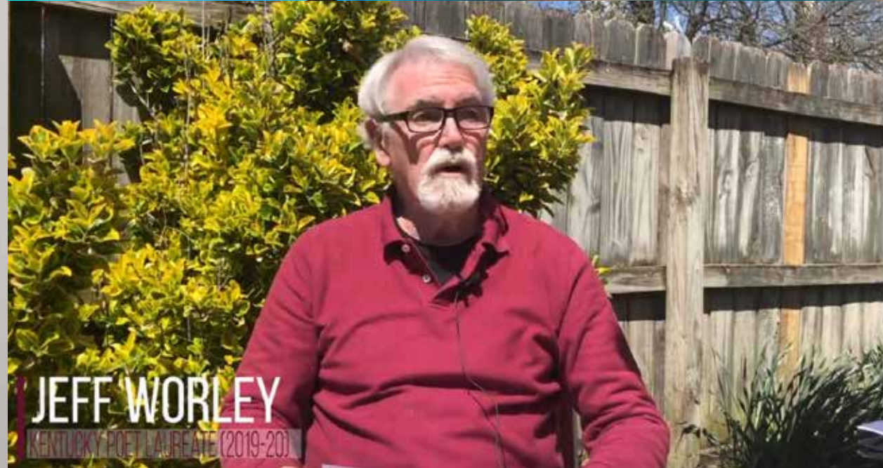
JEFF WORLEY KENTUCKY POET LAUREATE (2019-20)

With the COVID-19 pandemic in full swing and so many public events canceled due to public health guidelines, the Kentucky Arts Council remained committed to presenting as much programming as possible, but in a safe manner. Thus, the first ever virtual Kentucky Writers' Day was born.