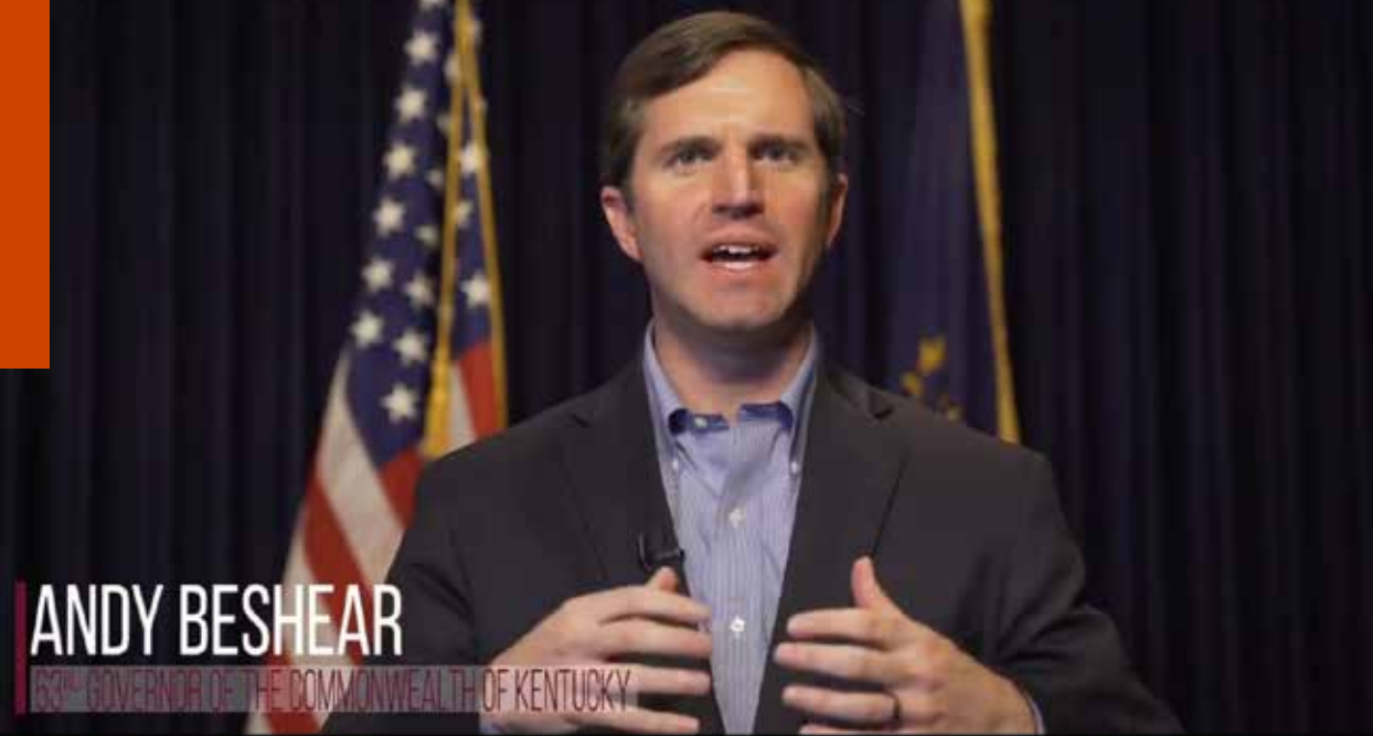
ANDY BESHEAR GOVERNOR OF THE COMMONWEALTH OF KENTUCKY