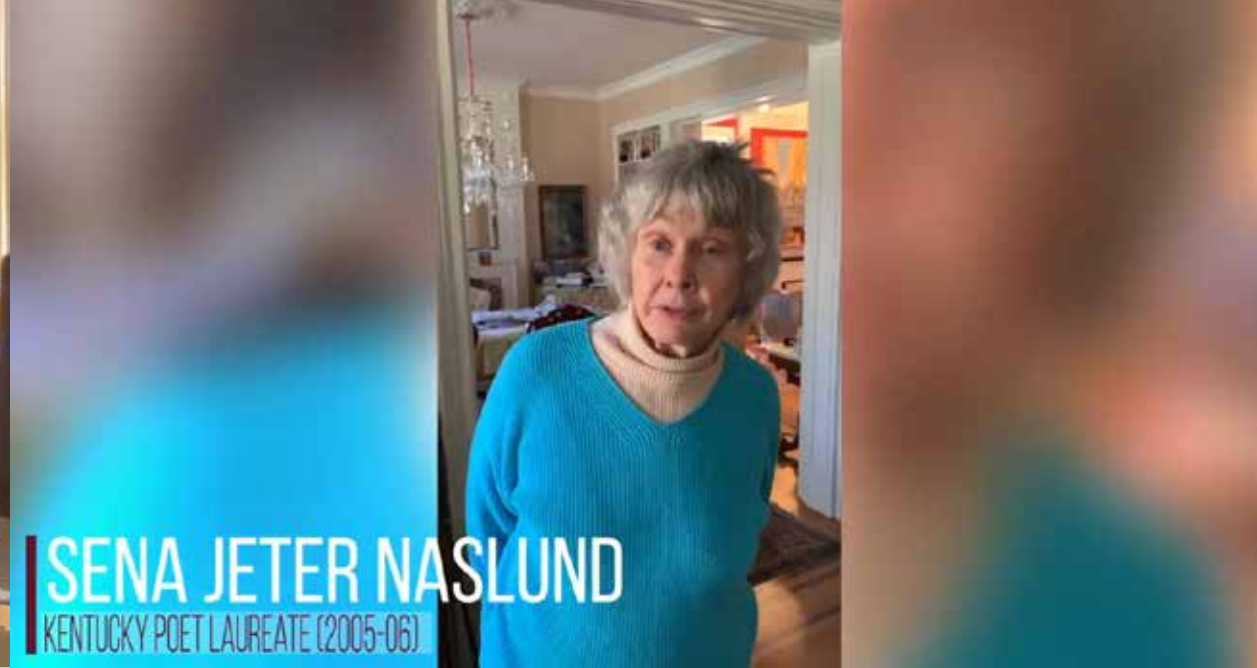
SENA JETER NASLUND KENTUCKY POET LAUREATE (2005-06)